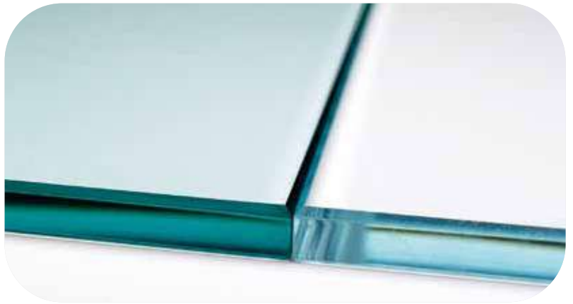
Pilkington Optifloat™ Clear